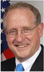
K. MICHAEL CONAWAY (chairman) Texas

2430 Rayburn House Office Building, Washington, DC 20515 Office: 202-225-3605 | fax: 202-225-1783 conaway.house.gov