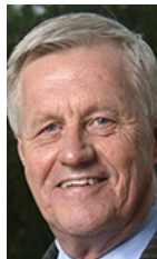
COLLIN C. PETERSON (ranking member) Minnesota

2204 Rayburn House Office Building, Washington, DC 20515 Office: 202-225-2165 | fax: 202-225-1593 collinpeterson.house.gov